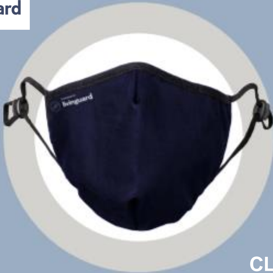
CLARION MASK (**)